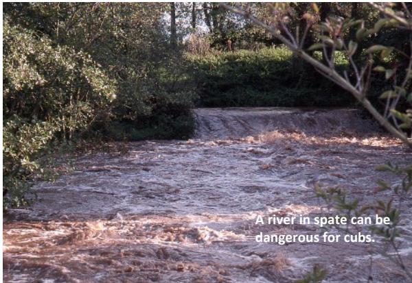
A river in spate can be dangerous for cubs.

Otters suffered an enormous decline in Britain in the '60s and '70s. By 1984, they had vanished almost to the point of extinction, not just in the industrial areas, but in rural areas too. Nobody had intended them harm, but their environment had become poisonous to the extent of being fatal.